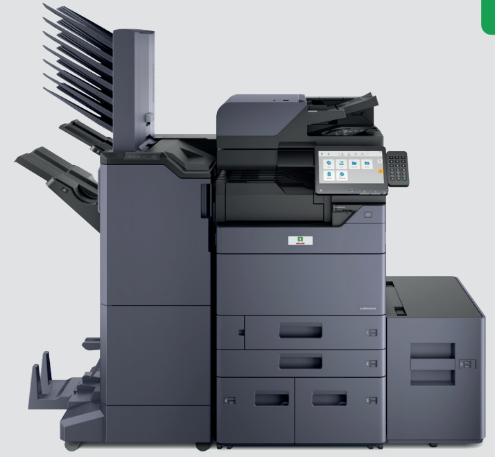
Model configured with: DP-7170; NK-7120; DF-7140; BF-730; MT-730(B); PF-7150 and PF-7120.