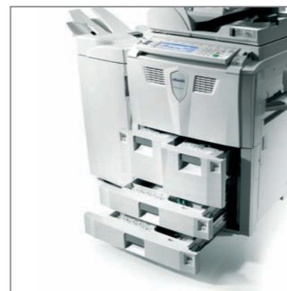
LARGE PAPER RESERVE with availability of up to 8,100 sheet