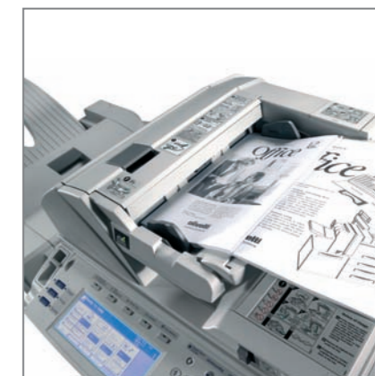
Concurrent front/rear function with DOUBLE SCANNER