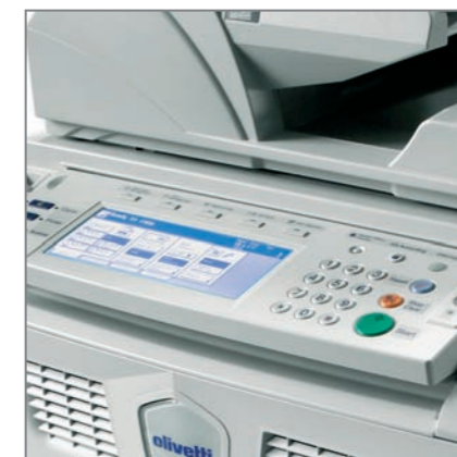
SLOPE-ADJUSTABLE and easy accessible console